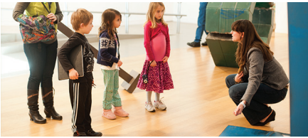
Top: Courtesy, deCordova; Middle: Photo: Anne Albers; Bottom: Photo: deCordova

Discover contemporary art and sculpture across 30 acres